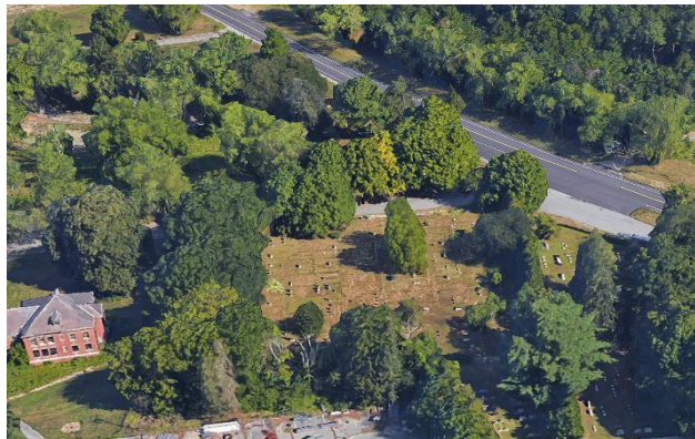
Aerial photograph of the Cemetery located next to the demolished Norwich Hospital

Recently published in a local newspaper was an article about how this cemetery is in the middle of a proposed construction project. This being another reason why we want to restore this cemetery and keep it in tip top condition. The land was purchased by the Mohegan Indian Tribe who operated the successful Mohegan Sun Casino.