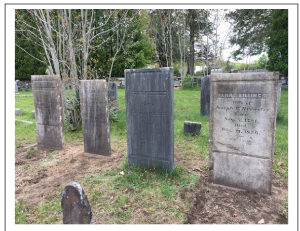
The after photo of the repairs on the stones