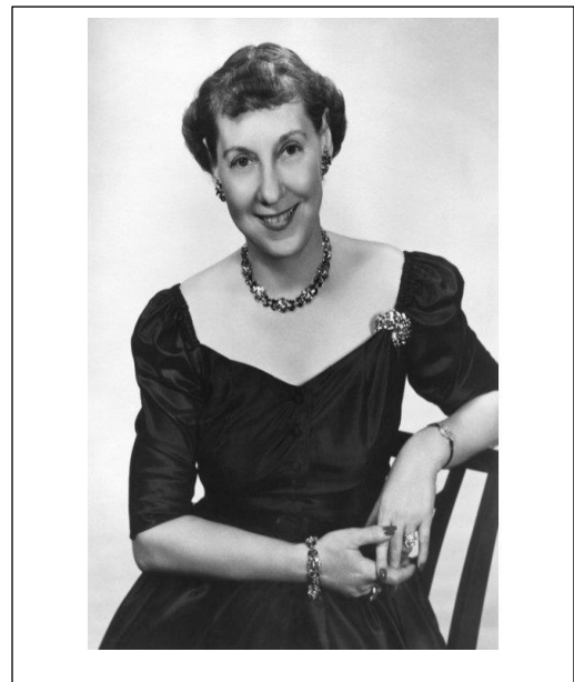
Mrs. Mamie Doud Eisenhower